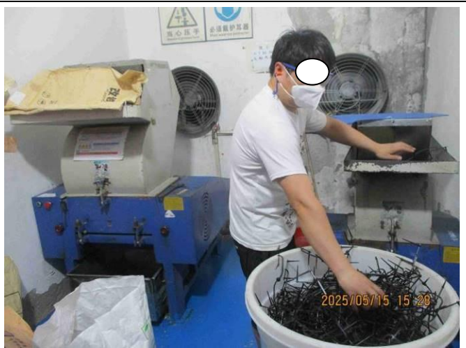
The curing worker worn PPEs properly