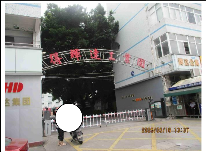
The gate of industrial park