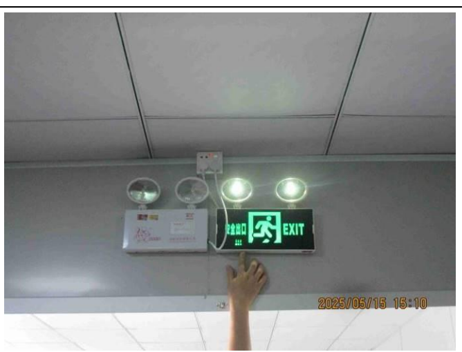
Emergency light testing