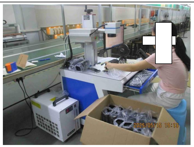
NC (7.6): The laser carving worker did not wear provided dust-proof mask and protective goggles.