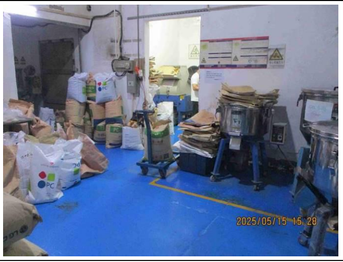
Crushing and mixing