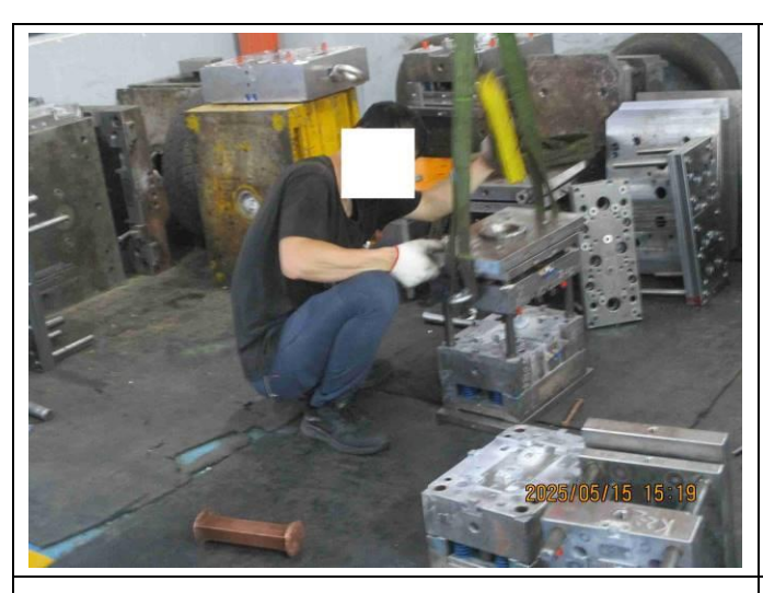
NC (7.6): The up and down moulds worker did not wear provided safety shoes and safety helmets.