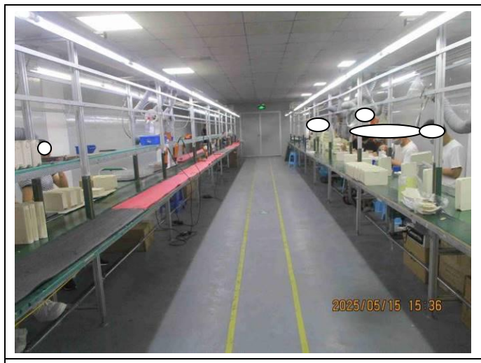
Assembling and Packing