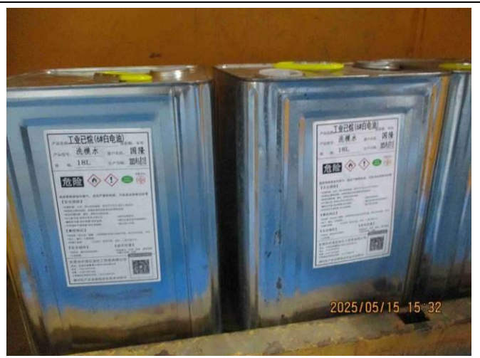
Safety label for chemicals