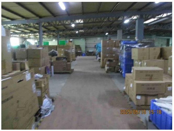
Materials and finished goods warehouse