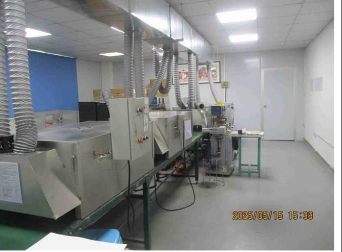
Pad printing (it was not in production during audit)