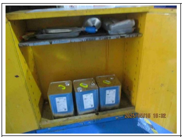
Chemical stored in explosion-proof cabinet