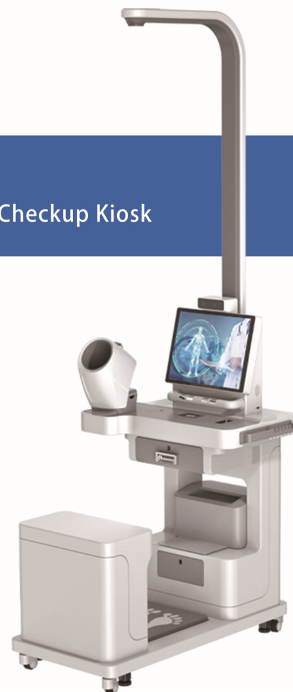
SH-T15 Health Kiosk