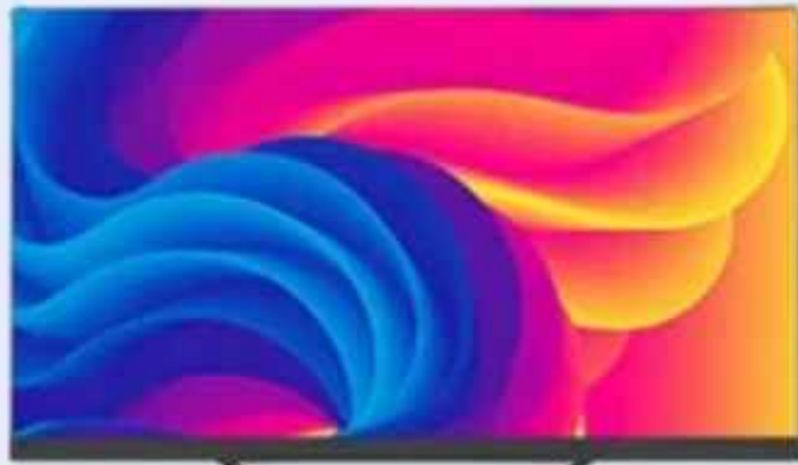
Bezel -Less | Black / White color