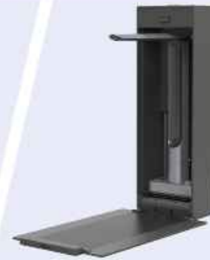
Wireless Visualizer K6