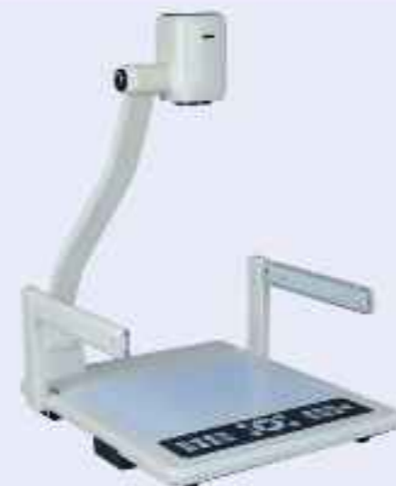
Desk Visualizer G9