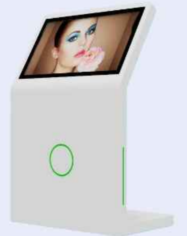
Inquiry Advertising Display 32" , 43", 55", 65" - Android OS, touch screen (capacitive / infrared option)