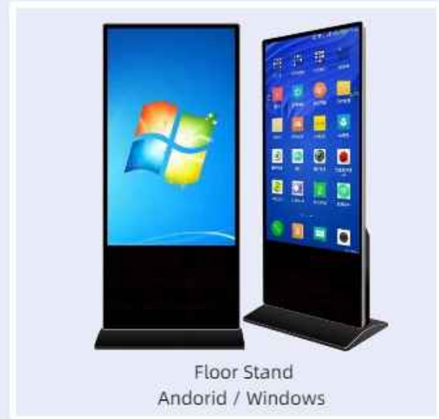
Floor Stand Andorid / Windows