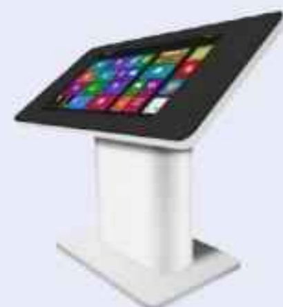
43", 55", 65" Electric Flip Table