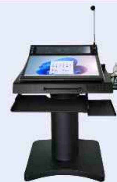
Digital Podium Lifting/ Dual Screen