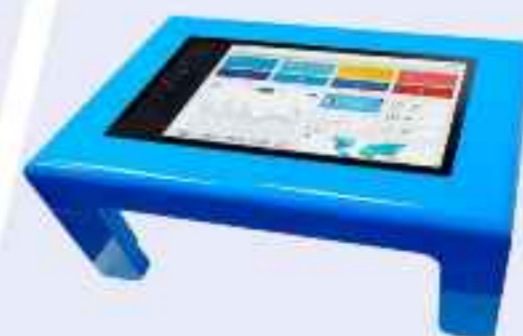
32", 43", 55" Kids Game Table