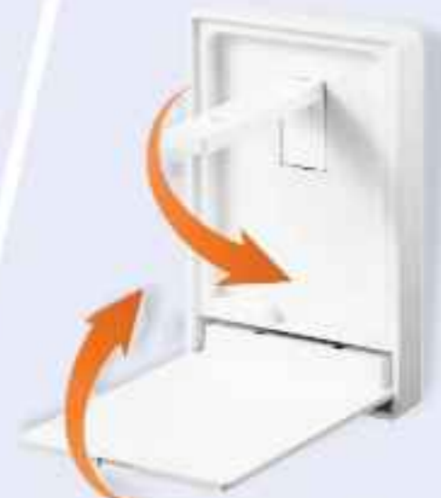
Document Camera V4

E: info@itatouch.com https://www.itatouch.com