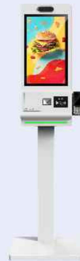
Self-service Advertising 18.5", 21.5", 27", 32" - QR /Scanner, ticker printer & credit card reader