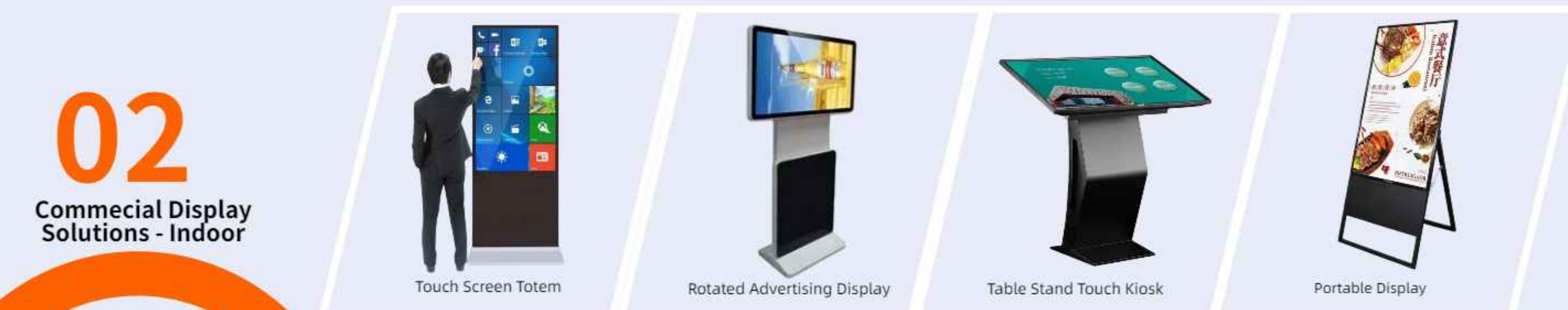
Touch Screen Totem