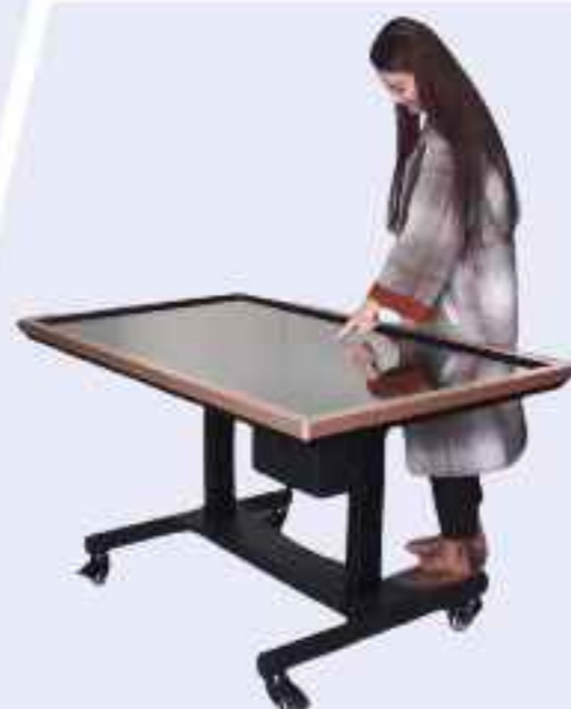
Motorized Flip Trolley