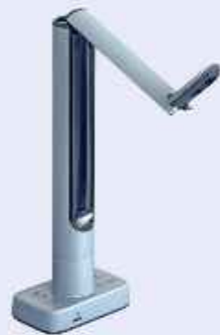
Portable Camera K6-F