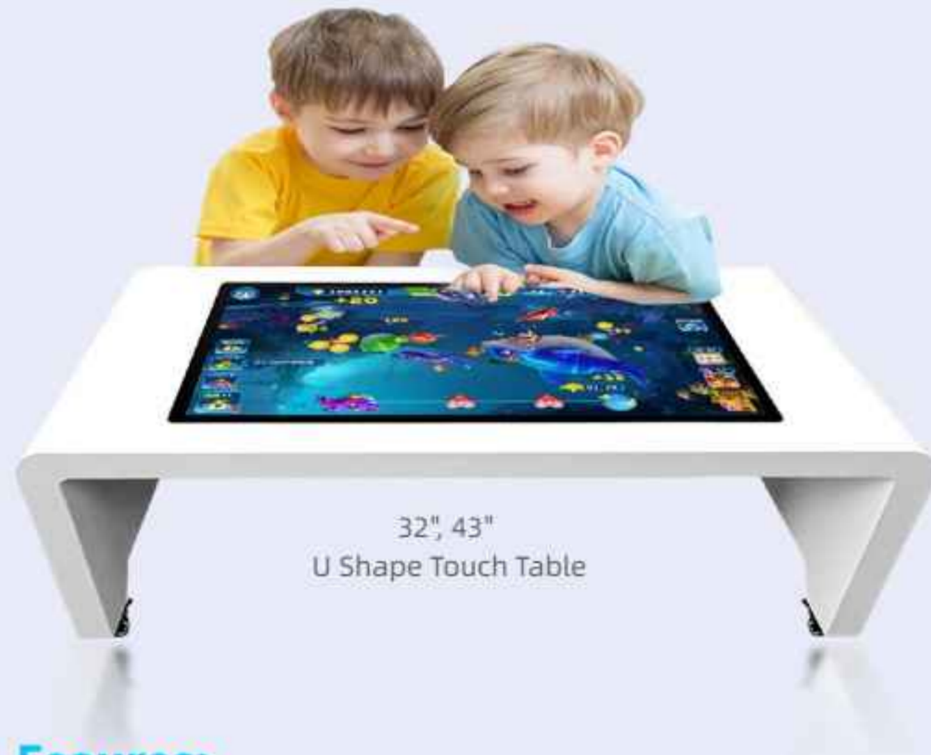
32", 43" U Shape Touch Table