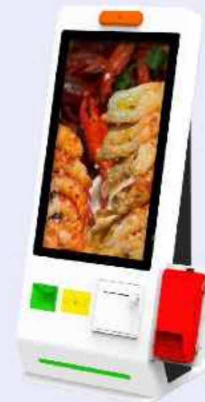
Ordering Machine 21.5" - QR /Scanner, ticker printer & credit card reader