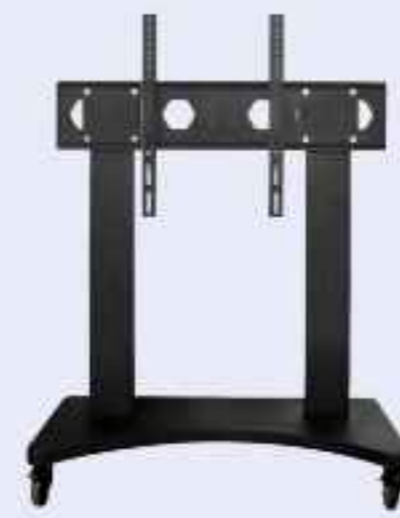
Motorized Lifting Carts