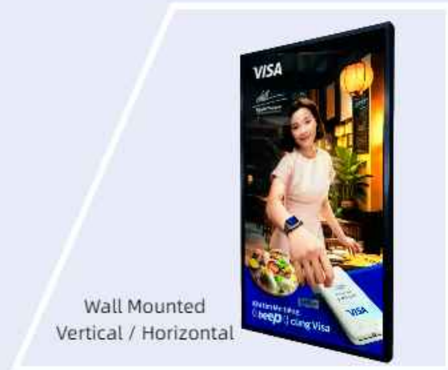
Wall Mounted Vertical / Horizontal