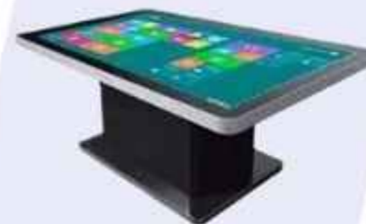
43", 55", 65" T Shape Table