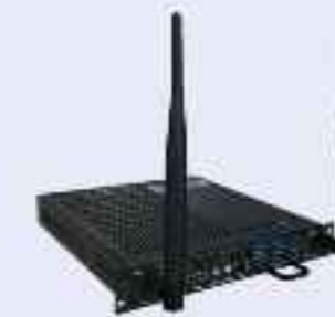
OPS PC Intel I5/I7 13th CPU , Windows 11