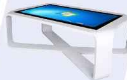
43", 55" X Shape Table