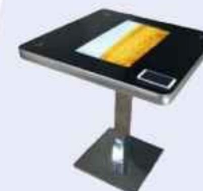
21.5", 23.8" Coffee Table