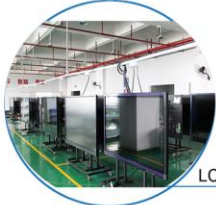
LCD Interactive Touch

TECHNOLOGY: Working with a professional R&D team, basing on the practice of interactive touch teaching, make us to be top one.