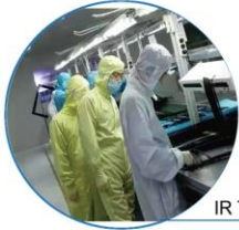
IR Touch Frame

TECHNOLOGY: Working with a professional R&D team, basing on the practice of interactive touch teaching, make us to be top one.