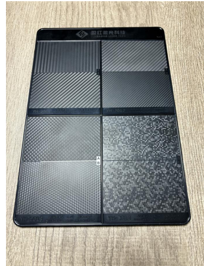
Mold Texture 5