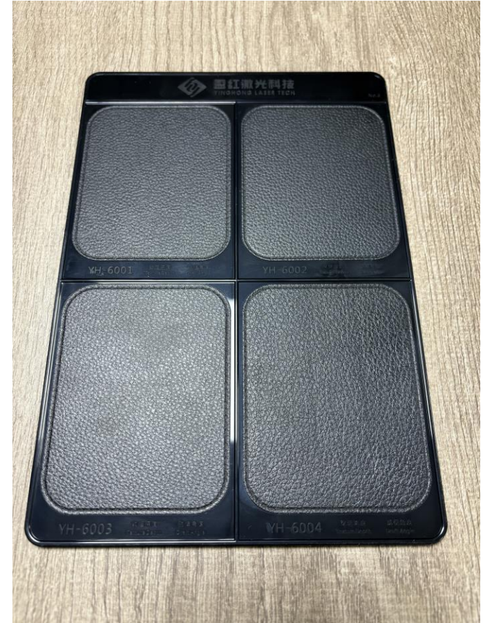
Mold Texture 8