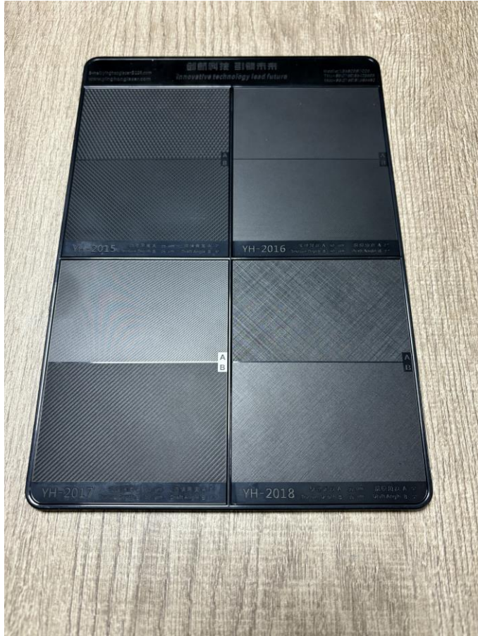
Mold Texture 6

Injection mold surface finishing can be polishing, texturing and specific surface. Here are some texturing samples we usually use. Click here to download. It will give you some inspiration if you don't know which finishing to use. Any copyright issue, please contact us to delete it.