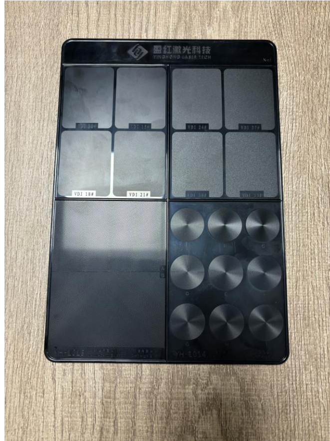
Mold Texture 4