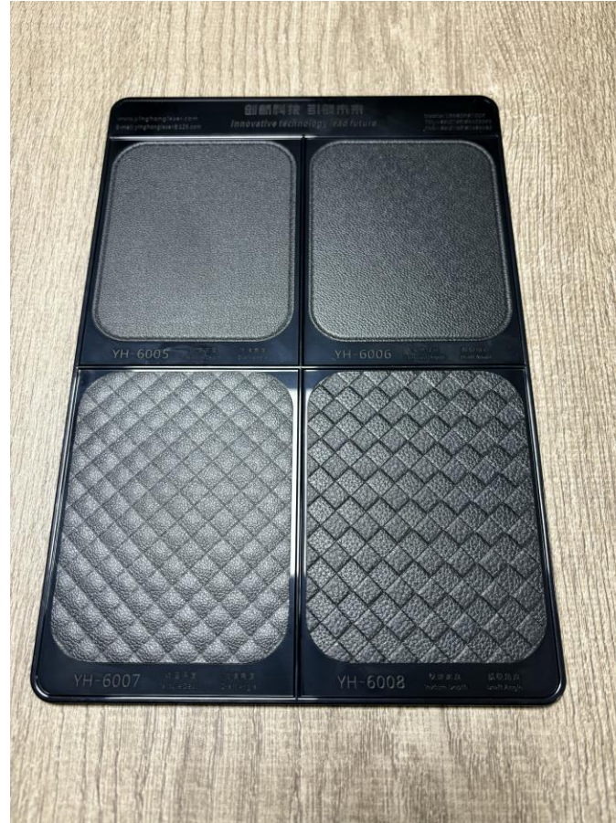
Mold Texture 7