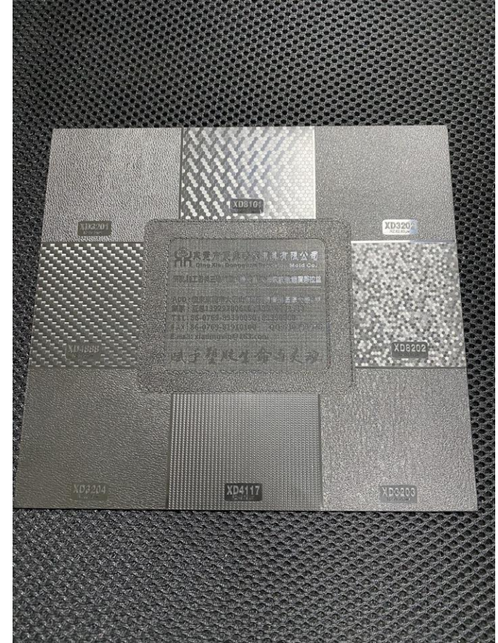
Mold Texture 2