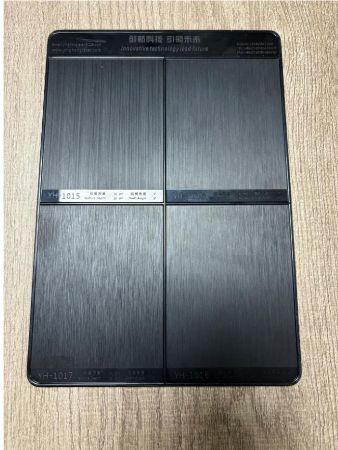
Mold Texture 3

Injection mold surface finishing can be polishing, texturing and specific surface. Here are some texturing samples we usually use. Click here to download. It will give you some inspiration if you don't know which finishing to use. Any copyright issue, please contact us to delete it.