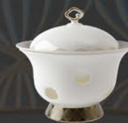
BOWL WITH WARMER