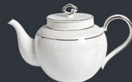
TEA POT HS188061 24.5*8.5*11.5CM