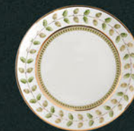
SHALLOW PLATE HS194803 20.5*2.4CM