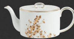
TEA POT HS202137 22.4*9.9*8.5CM