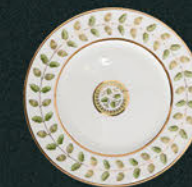
FLAT PLATE HS194801 20.6*1.6CM