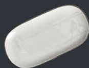
NAPKIN DISH HS188056 18*9.3*1.2CM