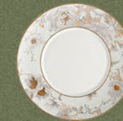
PLATE HS202098 30.1*2.5CM 12"