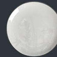
PLATE HS188048 20.7*1.8CM 8"