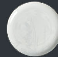
PLATE HS188046 21.1*2.1CM 8.25"