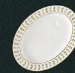
FISH PLATE HS194798 36.2*26.8*3.5CM HS194799 41*30.7*4CM HS194800 48.5*34.5*4.5CM