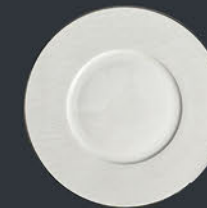
PLATE HS192171 28.3*2.1CM 11"