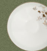
PLATE HS202113 24*4.8CM 9.5"