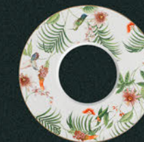
PLATE HS188026 30*1.7CM 11.75"