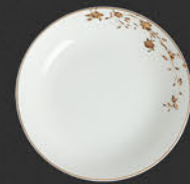
SOUP BOWL HS202144 16.3*3.4CM