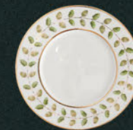
FLAT PLATE HS194802 28.6*1.9CM