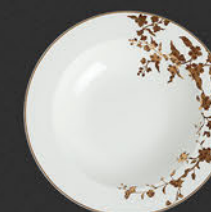
SOUP PLATE 9" HS202143 23*4CM