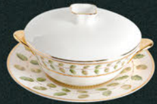
CUP WITH COVER

HS194810 13*5CM (CUP) HS194811 17.2*1.8CM (SOUCER)