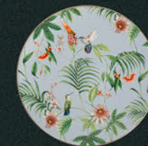
PLATE HS188028 28.9*2.4CM 11"