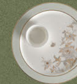
ICE CREAM PLATE HS202130 7.6*4.1CM (BOWL) HS202131 28*2CM 11" (PLATE)