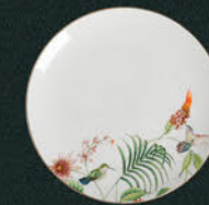
PLATE HS188029 20.7*1.8CM 8"