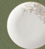
SHALLOW PLATE HS202097 20.3*2.1CM 8"