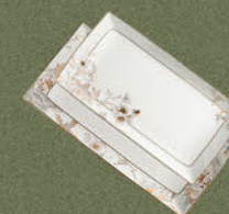
RECTANGULAR PLATE HS202119 35.6*18.2*2.4CM 14" HS202120 40.5*21.1*2.7CM 16"