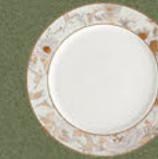
FLAT PLATE HS202111 26*1.8CM 10.5"