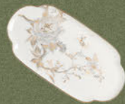
NAPKIN DISH HS202101 19.5*10*2.5CM