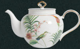
TEA POT HS188042 24.5*8.5*11.5CM