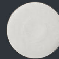
PLATE HS188047 28.9*2.4CM 11"