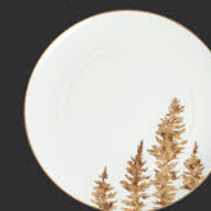
DINNER PLATE HS202134 27.8*2.6CM