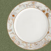
FLAT PLATE HS202112 30.8*1.9CM 12"