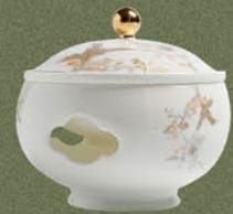
SOUP TUREEN HS202108 11*4.5CM (LID) HS202109 12*4.5CM