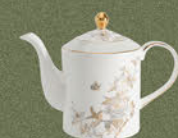
TEA POT HS202105 22.4*11.3*14.3CM