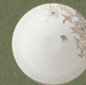
PLATE HS202123 28.1*5.4CM 11"