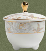
DESSERT POT HS202106 10*5CM (LID) HS202107 9*7CM