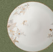
PLATE HS202124 33.5*6.1CM 13"