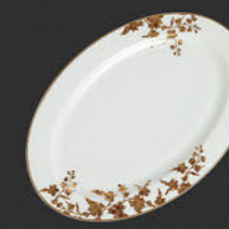
DEEP FISH PLATE HS202136 35.2*25.3*3.2CM