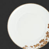
DINNER PLATE HS202135 20.3*1.8CM