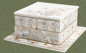
PLATE LID HS202116 14.3*1CM