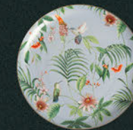
PLATE HS188027 21.1*2.1CM 8.25"