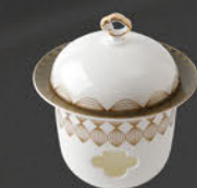
BOWL WITH WARMER