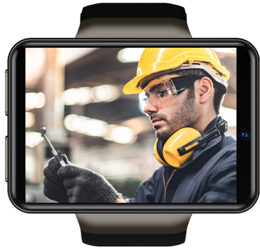
Ex Smart04 4G Full Frequency