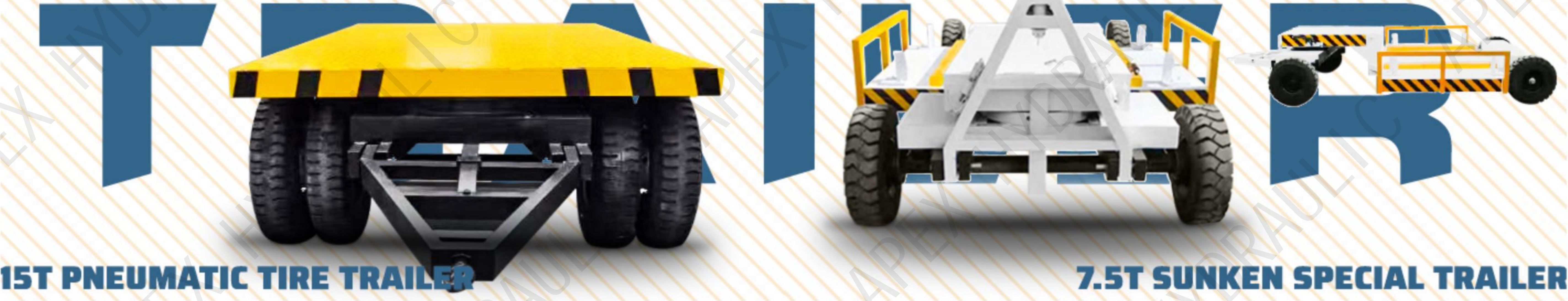
15T PNEUMATIC TIRE TRAILER