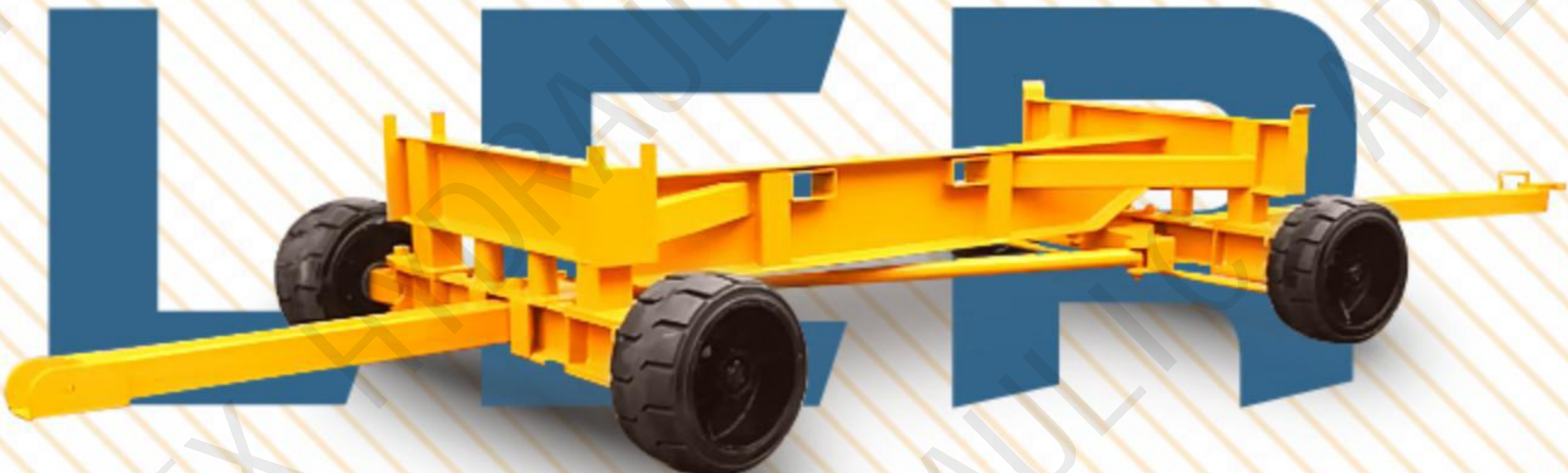
15T SKELETON STRUCTURE MILITARY TRAILER