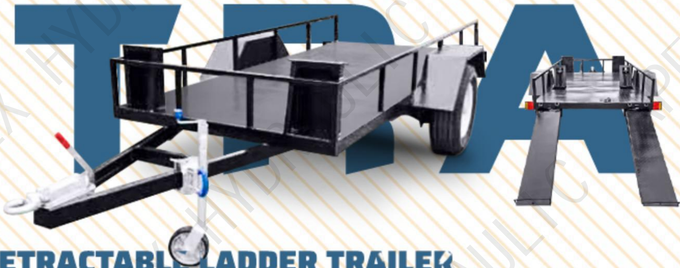
RETRACTABLE LADDER TRAILER