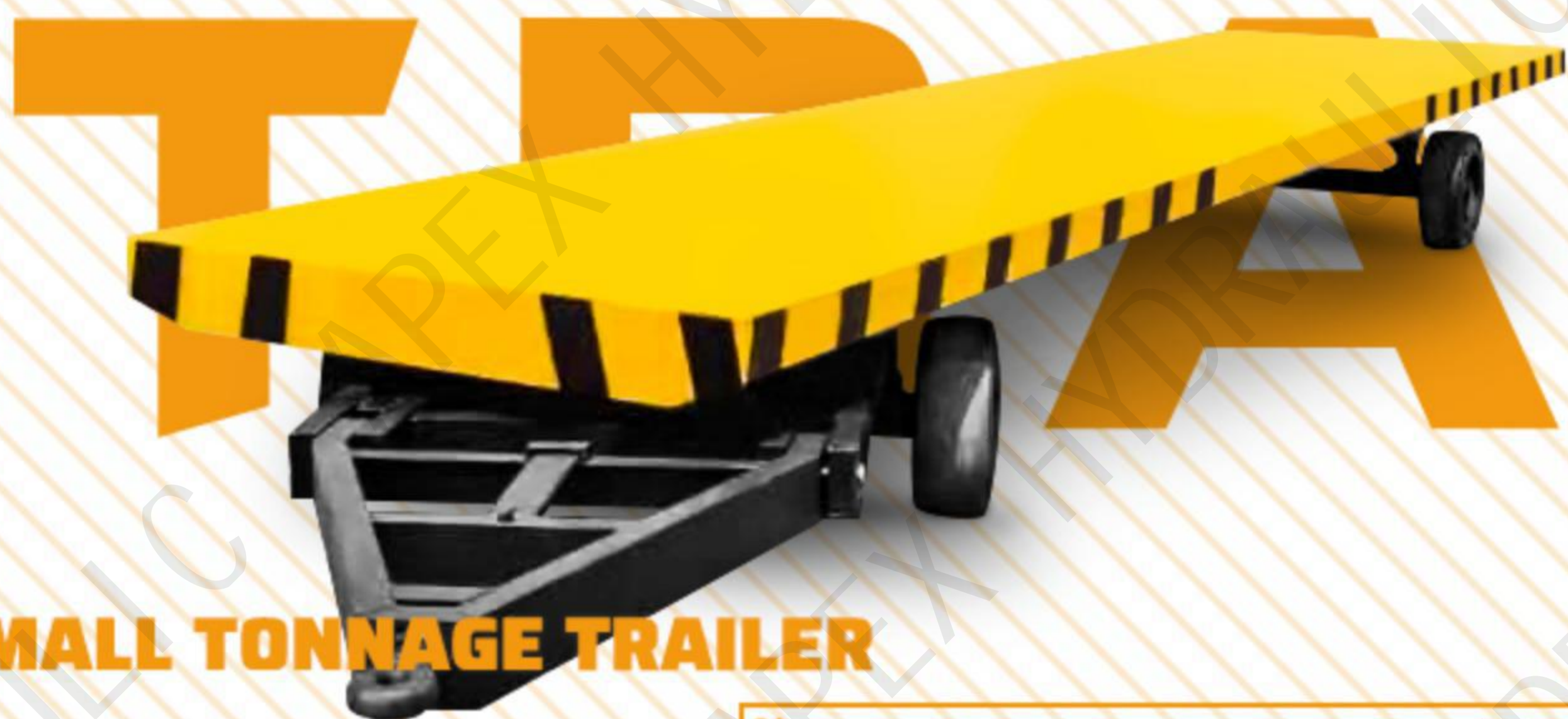
SMALL TONNAGE TRAILER