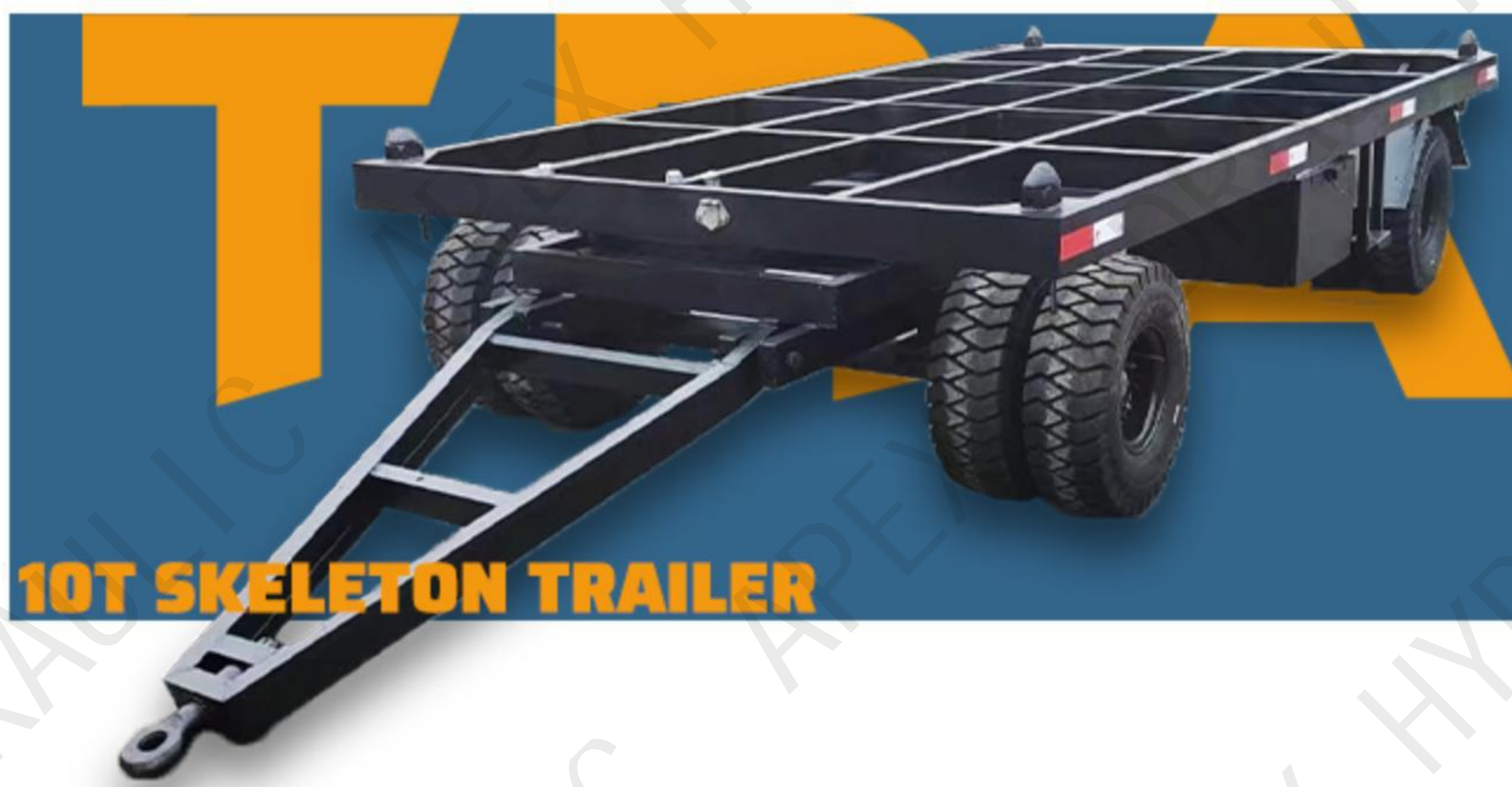
10T SKELETON TRAILER