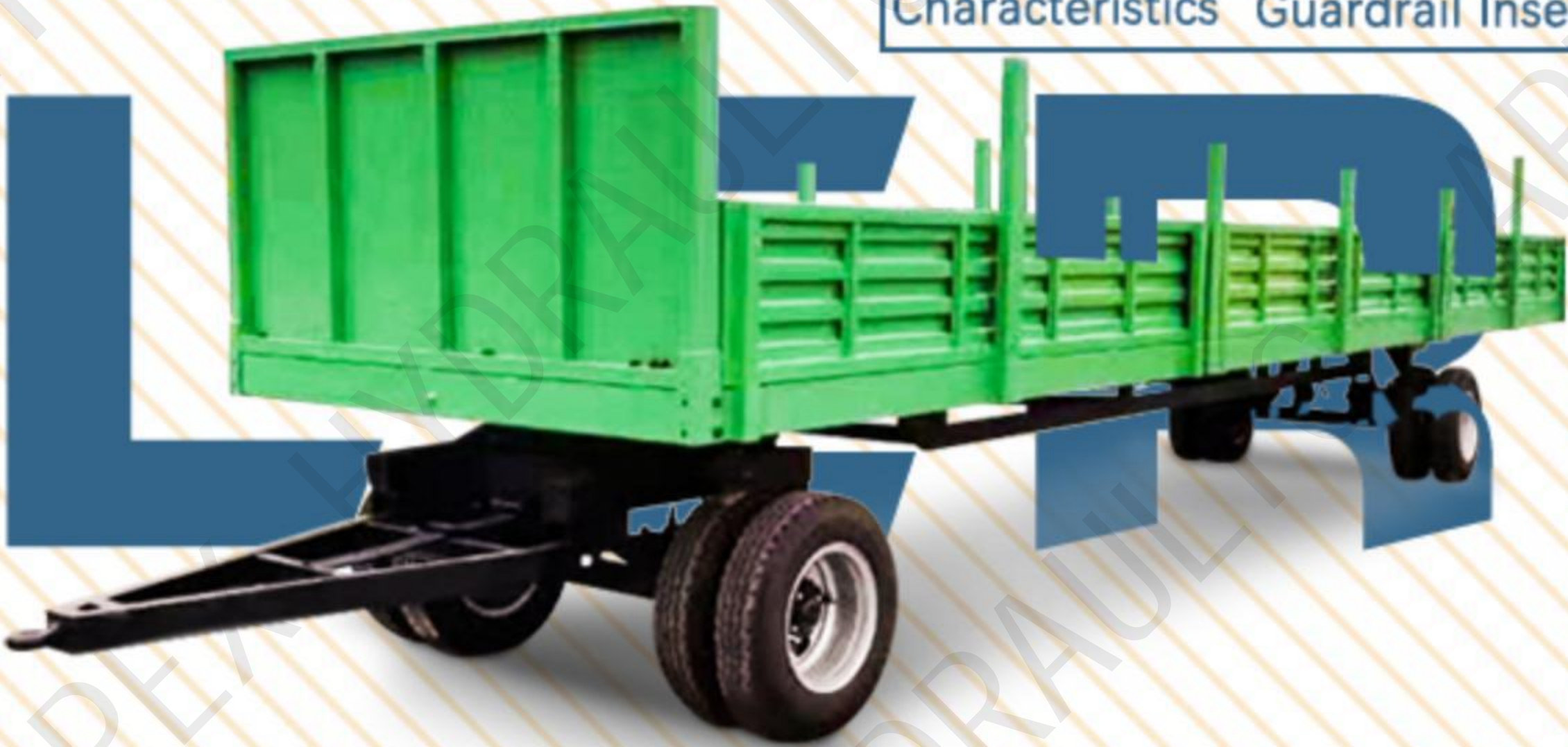
GUARDRAIL PILE TRAILER