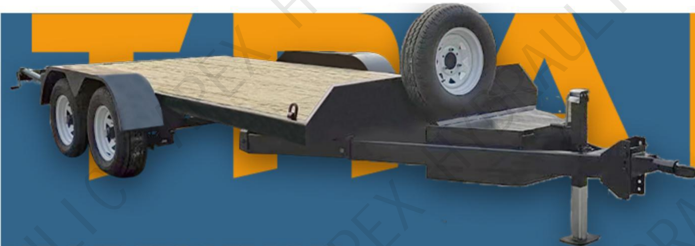
10T SKELETON TRAILER