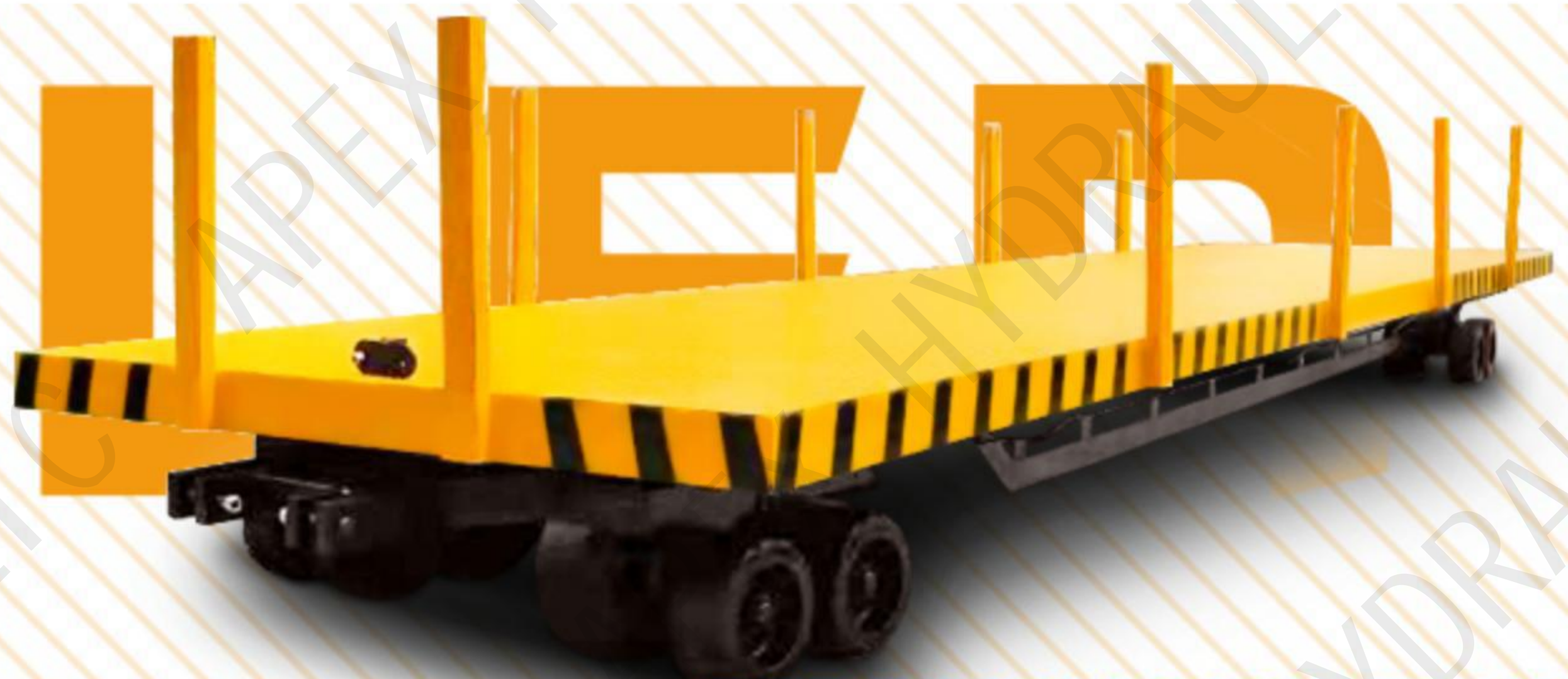
35T SUSPENSION TRAILER