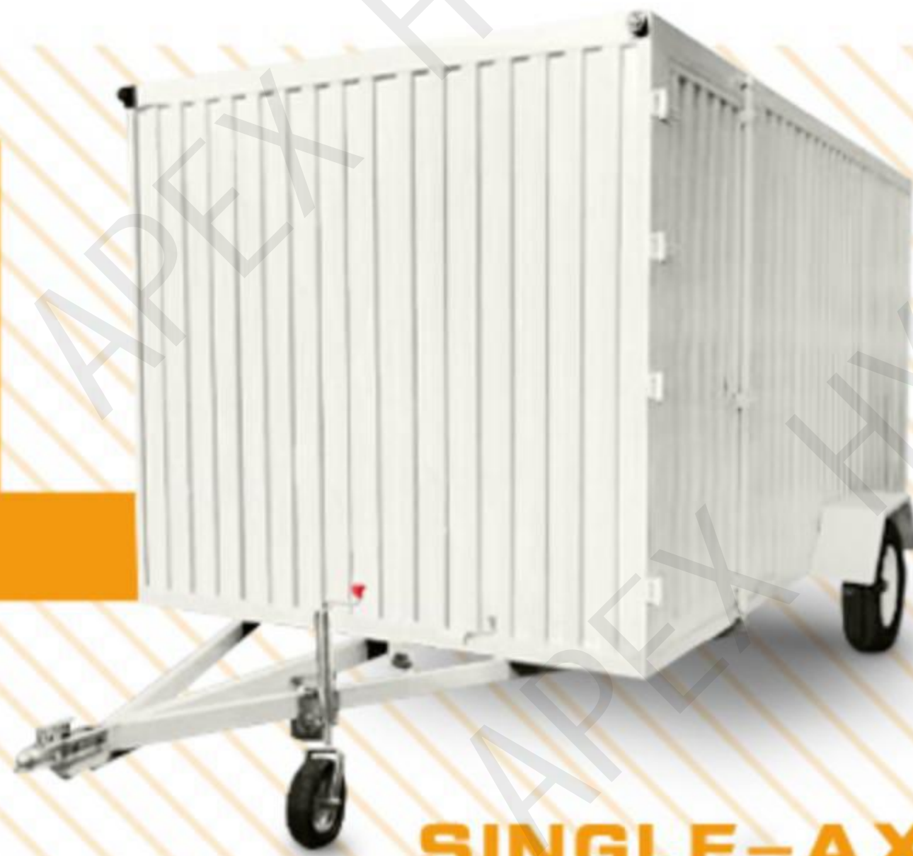
SINGLE-AXIS BOX TRAILER