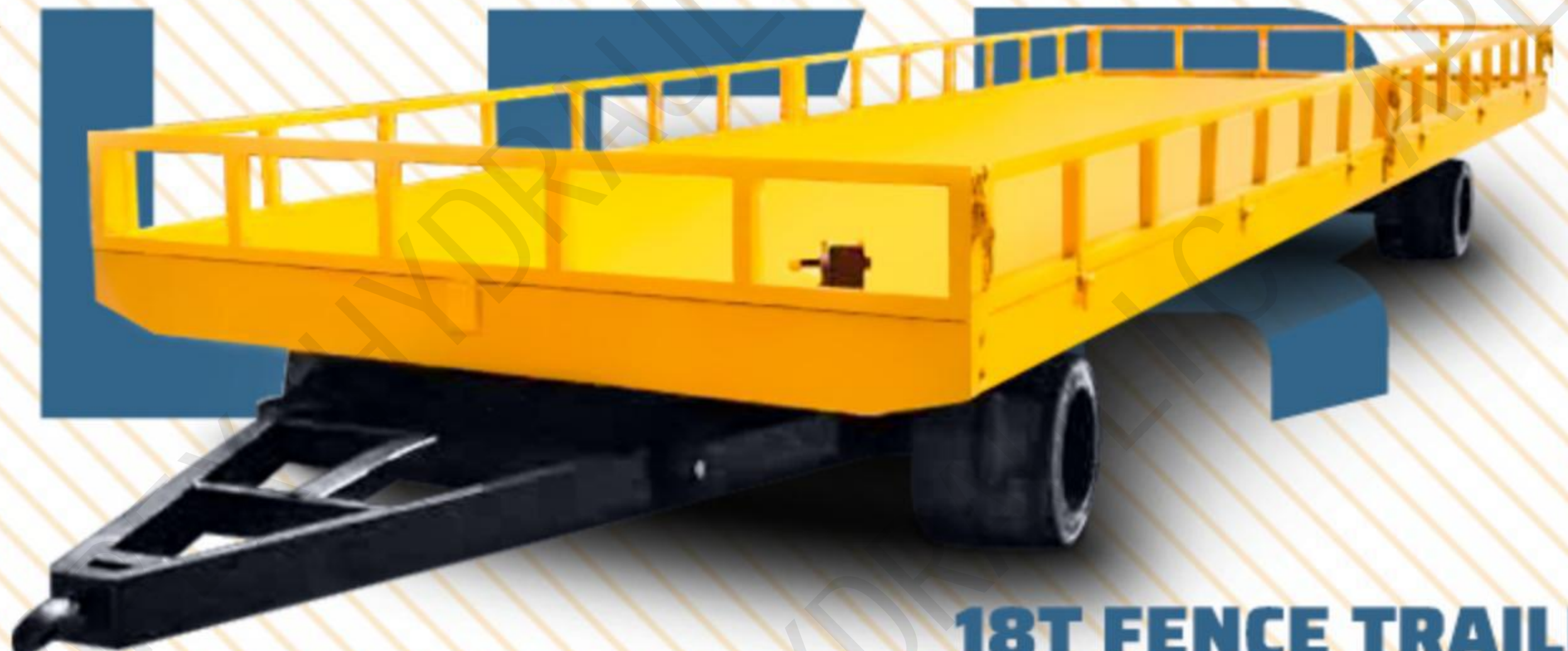
18T FENCE TRAILER