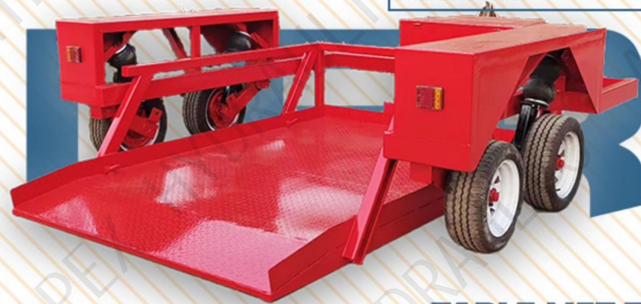
TABLE LIFT TRAILER