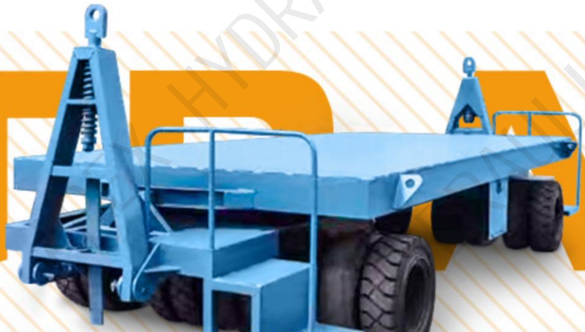
LINKAGE STEERING HEAVY-DUTY TWO-WAY TOW FLATBED TRAILERS