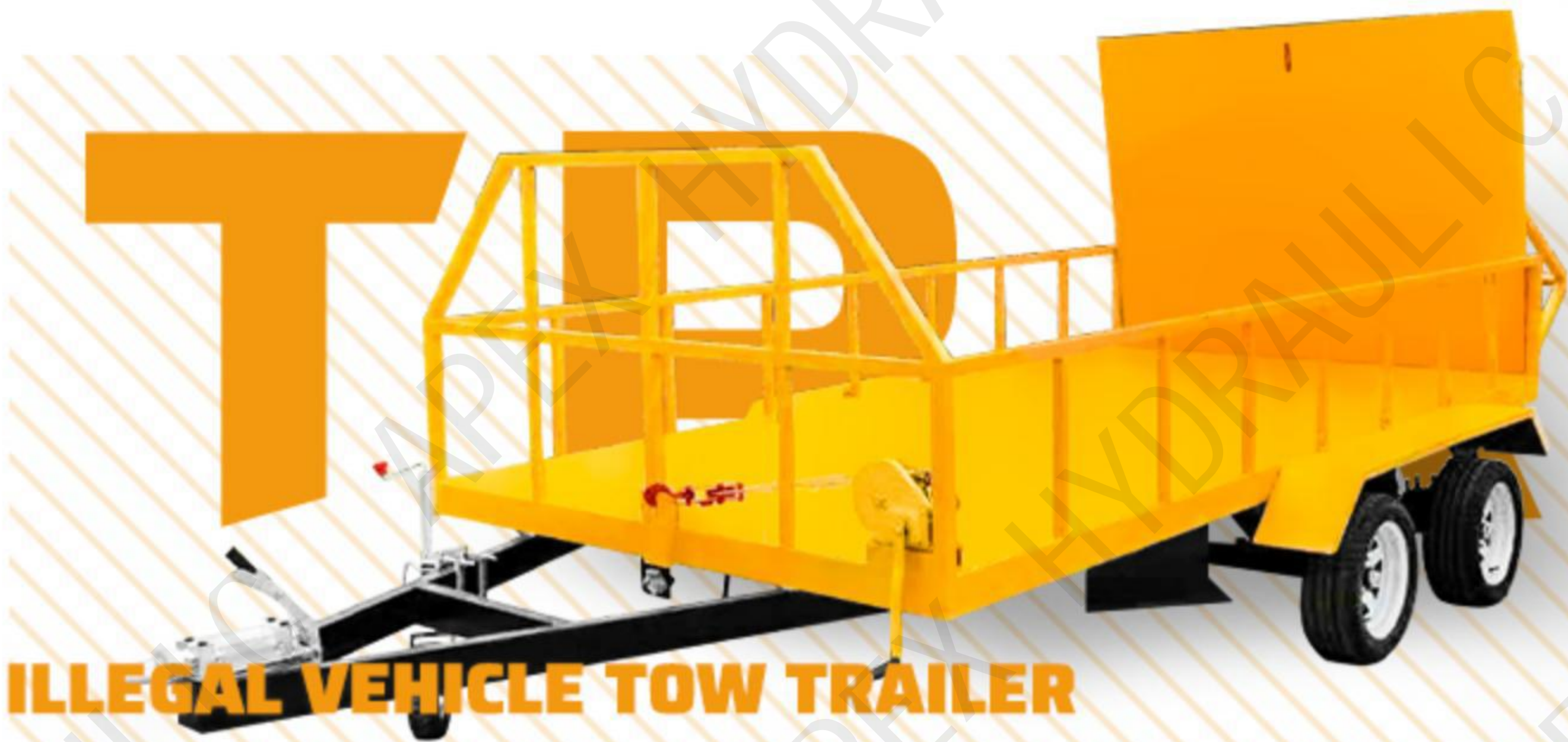
ILLEGAL VEHICLE TOW TRAILER