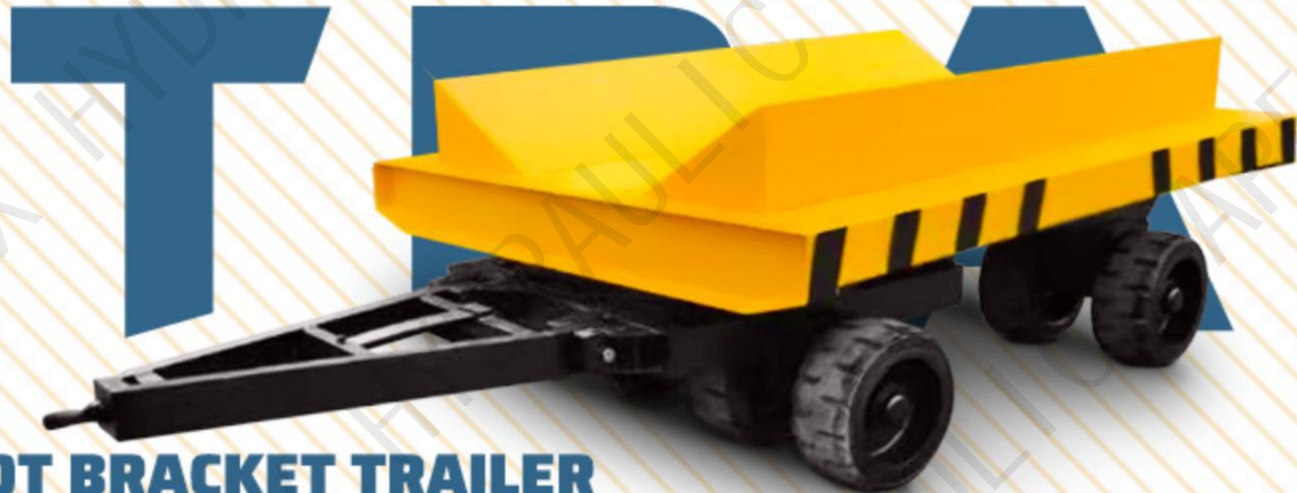
20T BRACKET TRAILER (COIL TRANSFER VEHICLE)