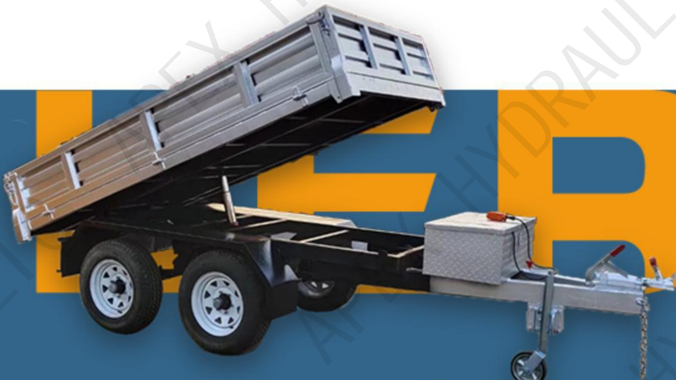
GALVANIZED TIPPING TRAILER

The farm trailer is used for four-wheel tractors, which is suitable for transporting various bulk goods on plains, wetlands, rural areas and highways. It has the characteristics of solid structure,safe, reliable and durable. There are two types of tractor trailers: dump trailers and not dump trailers.