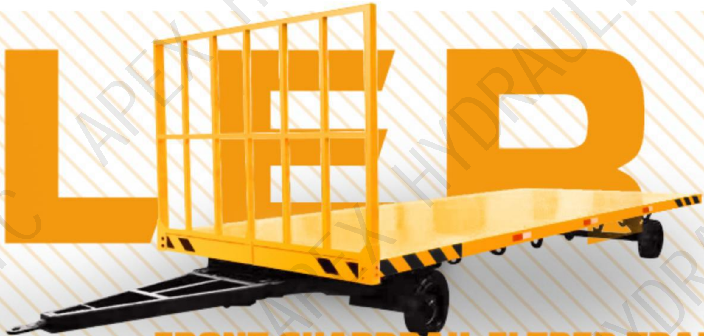
FRONT GUARDRAIL FLTBED TRAILER