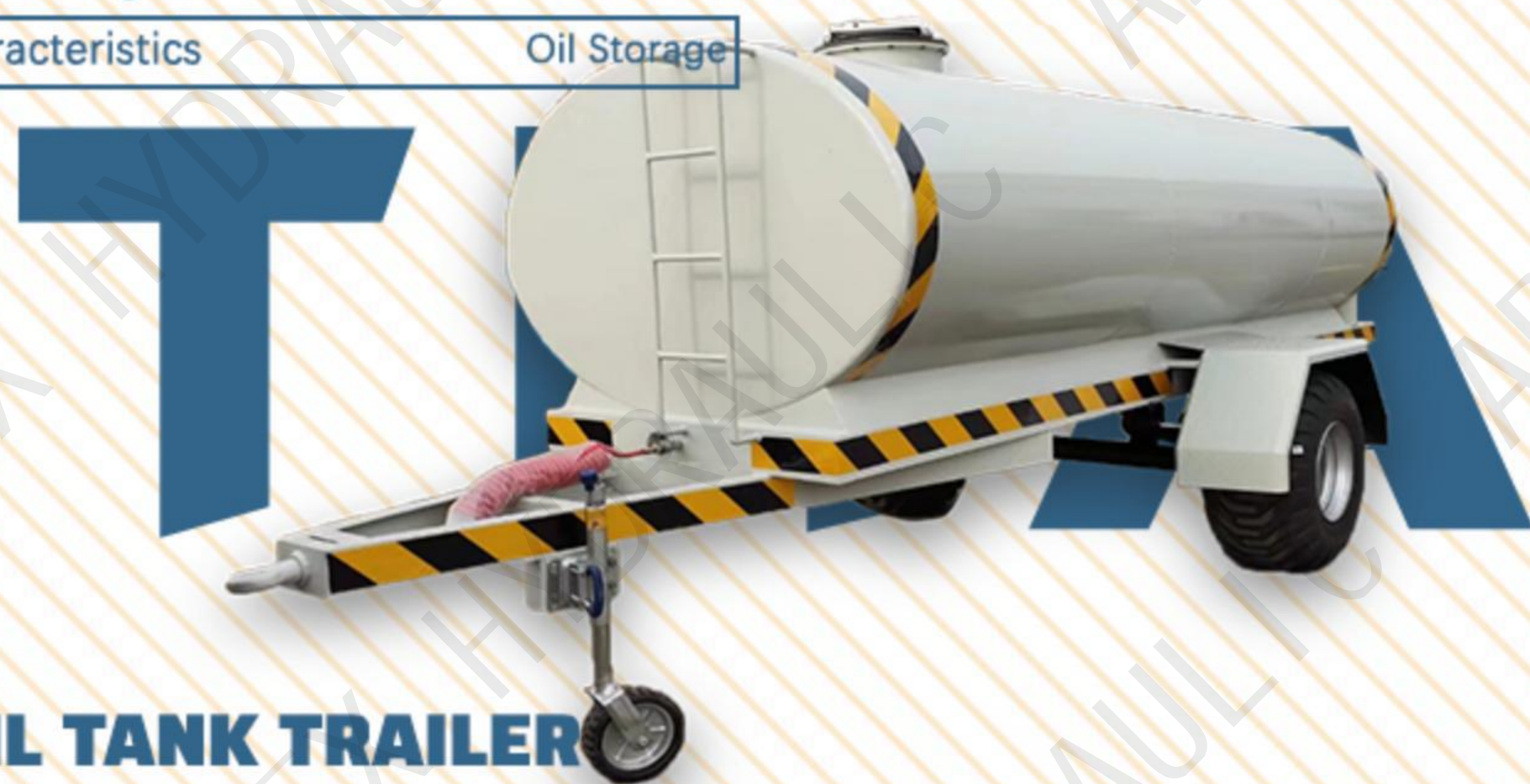
OIL TANK TRAILER