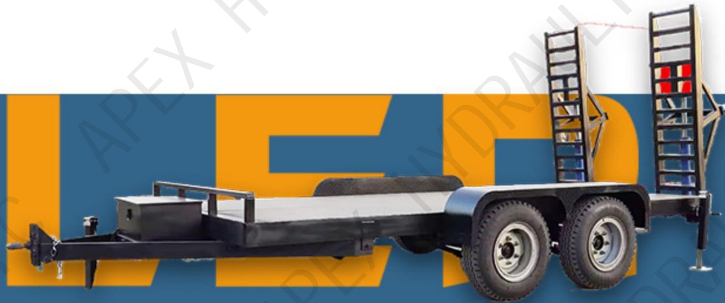
FLATBED CAR TRAILER

Skeleton trailer is made of longitudinal beam, beam and front and back end beam welded. Skeleton trailer no power, heavy load, safe use, affordable and other characteristics. Suitable for industrial heavy cargo transport turnover, workshop, industrial area, cargo yard short distance transport, etc.