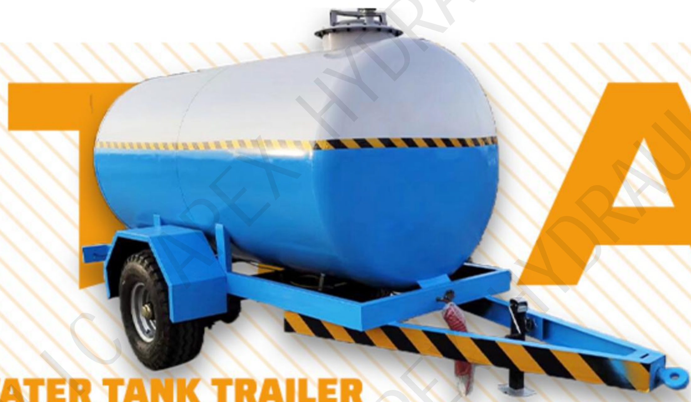
WATER TANK TRAILER