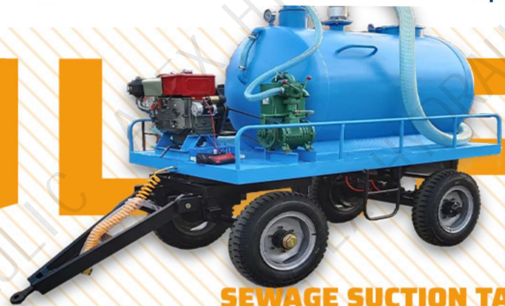
SEWAGE SUCTION TANK TRAILER