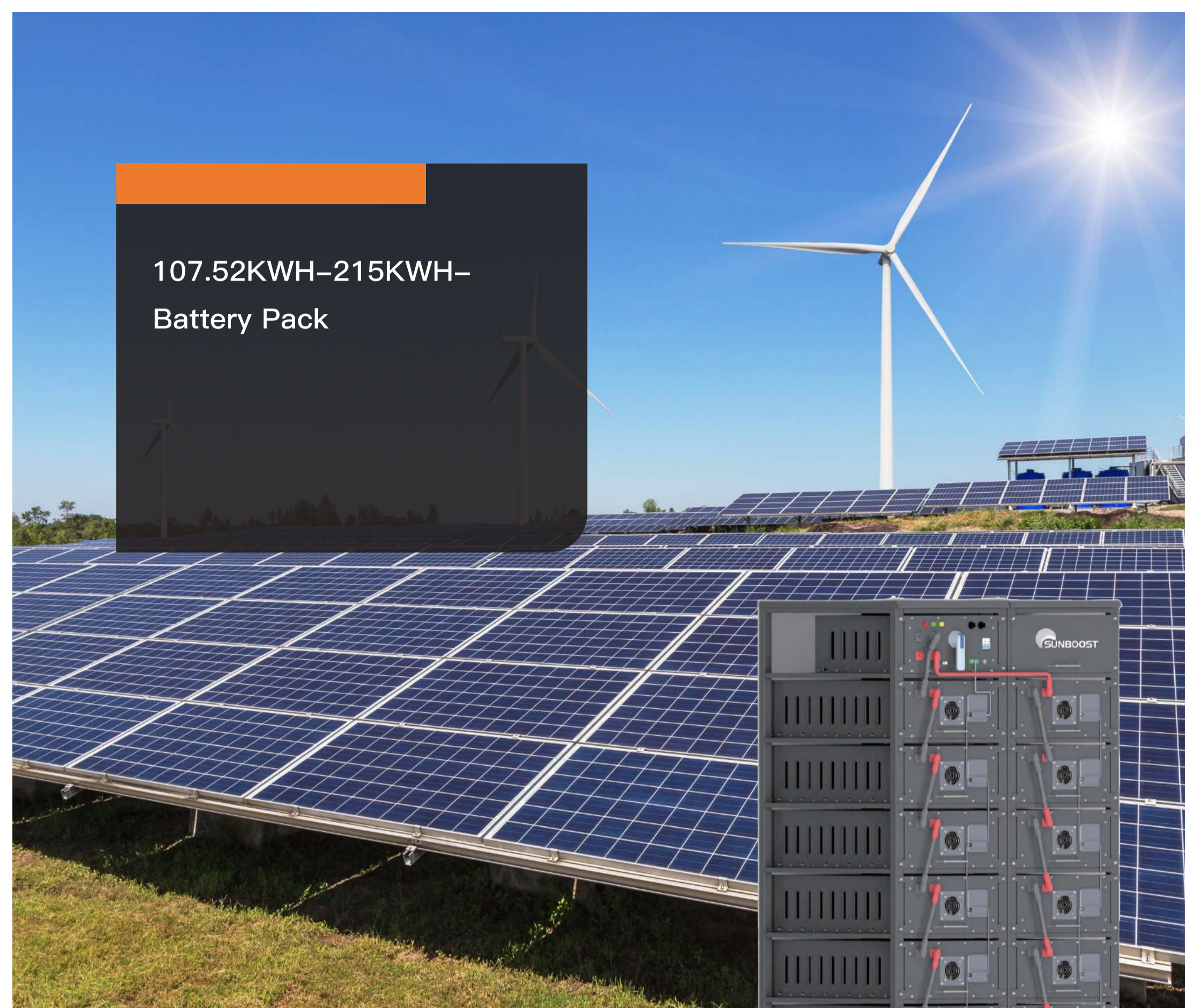
▲ This picture is for reference only, subject to the real thing !