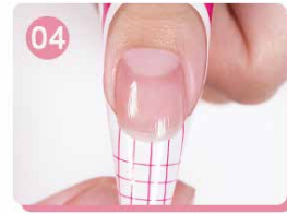
Remove the nails form and put it on the nails.