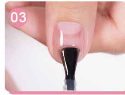
Apply base coat and cure it.