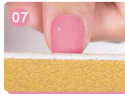
Polish and shape nails.