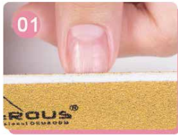
Trim the nails.