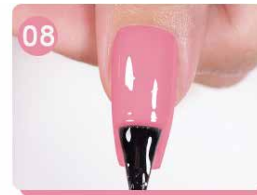
Apply top coat and cure it.