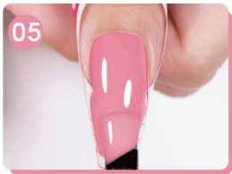
Apply quick extension gel and cure it.