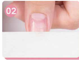
Clean your nail surface.