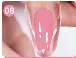
Peel off the nails form.