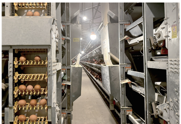
集蛋系统/Egg Collection System