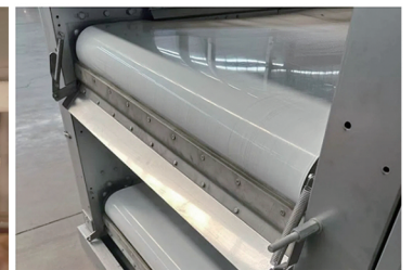
清粪系统/Manure Removal System

为客户提供最佳养殖设备方案 Provide customers with the best farming equipment solutions