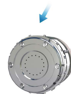
Die Face Plate