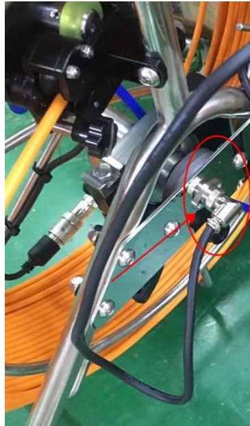
5pin to cable reel

When you connect big spring connector to the cable reel, please also use wrench screw it tightly. Otherwise the camera will be lost from cable reel