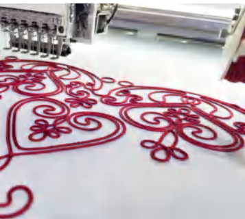
EASY CORDING DEVICE