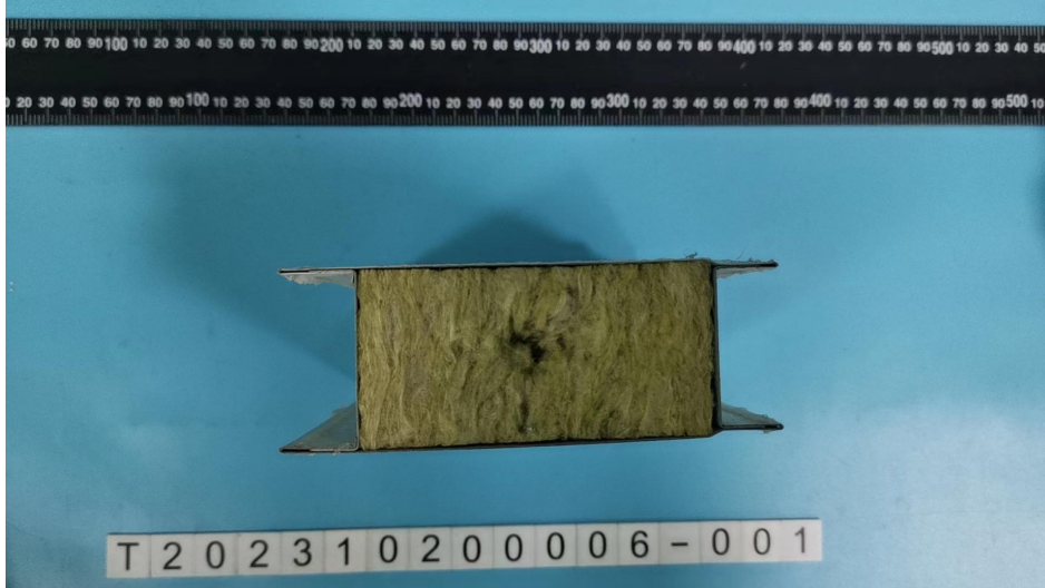
Sample No.: T202310200006-001