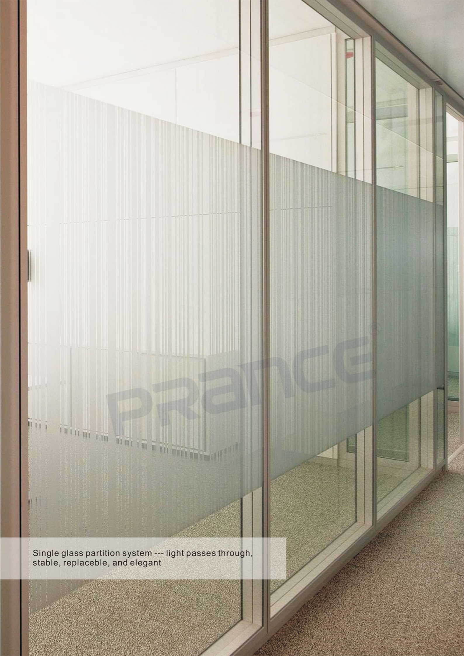
Single glass partition system --- light passes through, stable, replaceble, and elegant